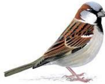
Sparrow Class Nursery Session 12.30-3.30pm