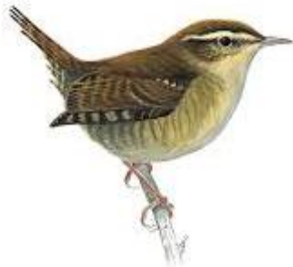
Wren Class Nursery Session 8.45-11.45am

Children who attend the Nursery classroom in the mornings will be known as Wren class. Children who attend the Nursery classroom in the afternoon will be known as Sparrow class.